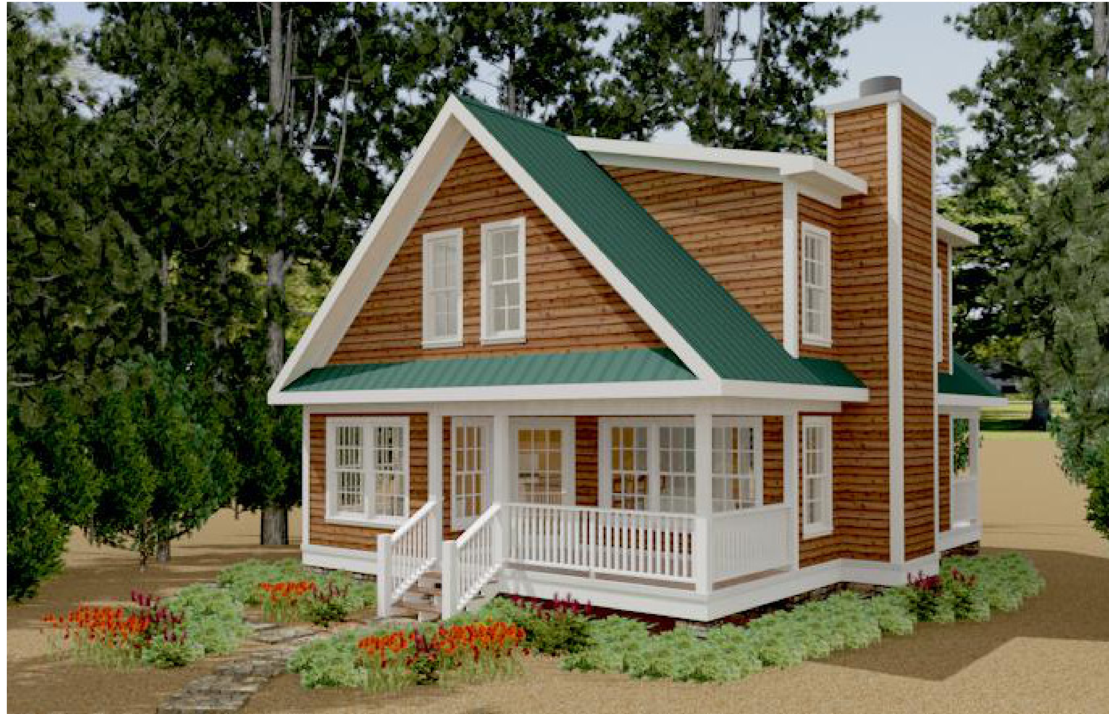
FRONT RENDERING OF CABIN PLAN - 2 BEDROOM - TYPE B-21